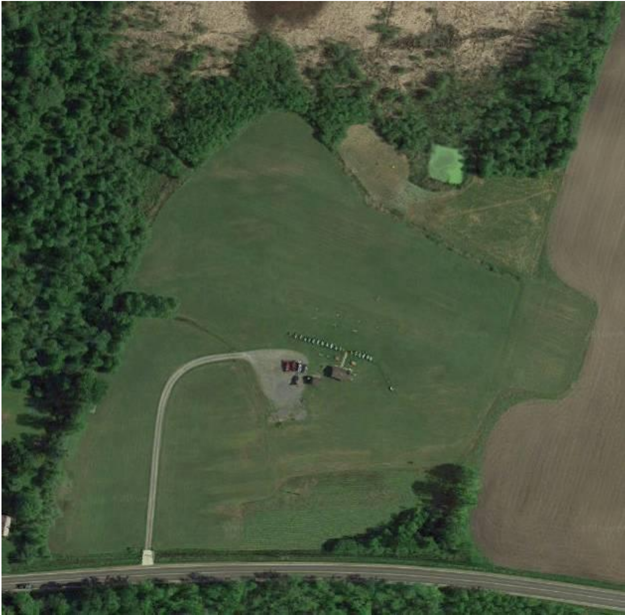
STARS Field Satellite photo